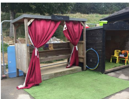
Australia class outside area